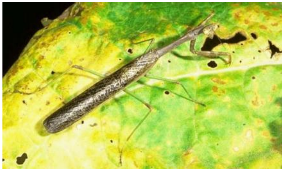
Male Carolina Mantid

There are three species of mantids in Kentucky, the European mantid ( Mantis religiosa ), Carolina mantid ( Stagmomantis carolina ), and Chinese Mantid ( Tenodera aridifolia sinensis ). The smaller, dusty brown Carolina mantid is only about 2 inches long when full grown, that is, when it has wings.