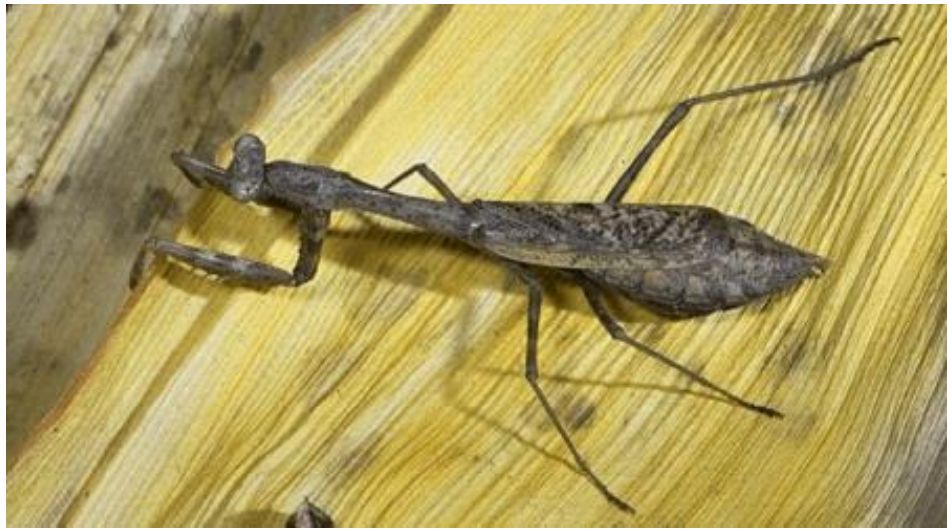
Female Carolina Mantid

The pale green European mantid is intermediate in size, about 3 inches in length. The large (3 to 5 inches long) Chinese mantid is green and light brown. The Carolina mantid is a native insect. The European and Chinese species were introduced in the northeast about 75 years ago as garden predators in hopes of controlling the native insect pest populations.