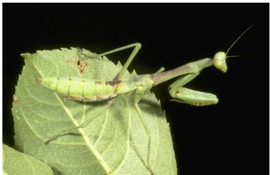
Mantid Nymph

The young mantids will eat many different types of insects that are about their own size or smaller. They can eat their siblings when food is scarce as they are cannibalistic. Fruit flies, pinhead crickets, and other small insects are excellent food for young nymphs. As the nymphs increase in size, larger prey can be provided.