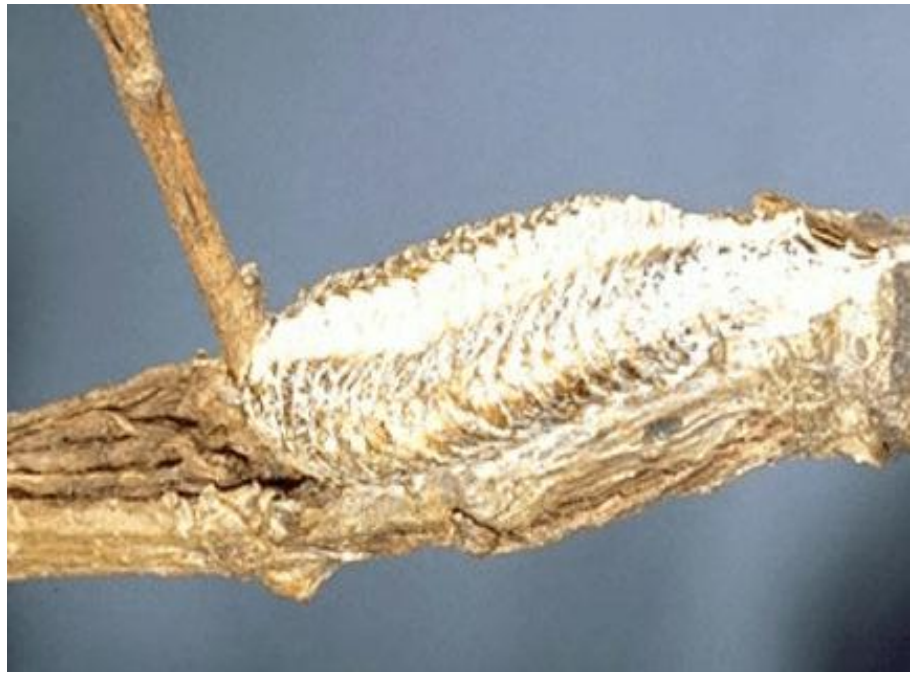
Mantid ootheca (egg case)

This makes an excellent classroom activity. Keep in mind that mantid egg cases collected in the fall and kept indoors will hatch during the winter months whether you are prepared for them or not. From a single ootheca, several dozen to hundreds of nymphs can emerge. Mantids need a warm, (70 to 90 degrees F) spacious container with the humidity between 40 and 95%. A ten-gallon terrarium works nicely.