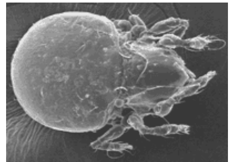
Figure 3: Image captured during a project by Croton-Harmon High School, Croton-on-Hudson, NY. Teacher: Donna Light-Donovan. Proposal number 1999-036.

Bugscope is one of many ITG projects -- collectively known as the World Wide Laboratory -- that provide interactive and remote access to imaging technology over the Internet through a variety of user interfaces. Other imaging technology available remotely includes the transmission electron microscope (TEM) and a magnetic resonance imager (MRI).